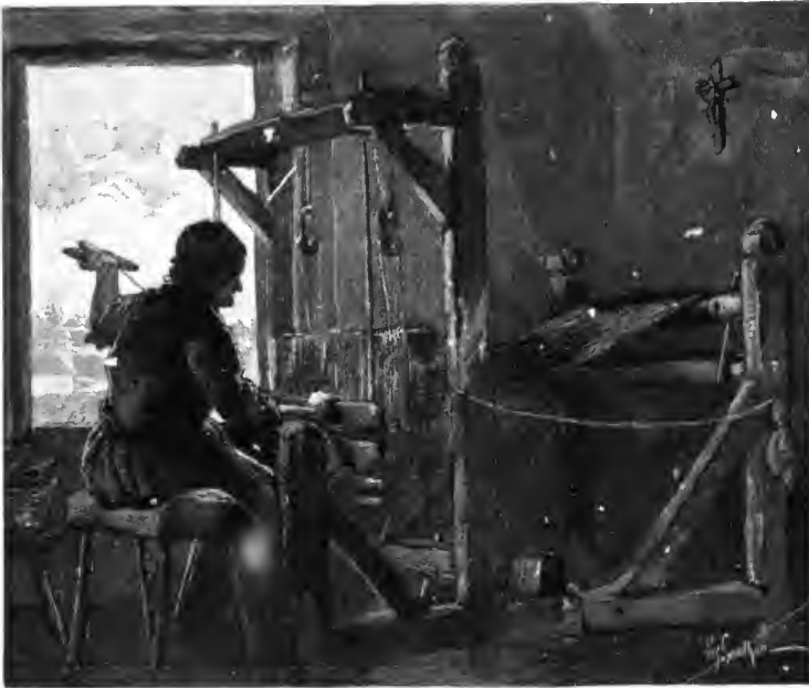
A CANADIAN INTERIOR.

It was not with the touching and simple spirit which led many to flock to the holy place in Jerusalem, in the time of the old Jewish law, that I went to La Bonne Ste. Anne. Nor was it with the unquestioning devotion of the Canadian peasant. I was simply a holiday loungee in search of the picturesque, with no more faith in La Bonne Ste. Anne than in the dozens of other shrines I had seen in Europe, and with a strong belief in the statements that, after the Crusades, innumerable relics were sold to the Latins by the